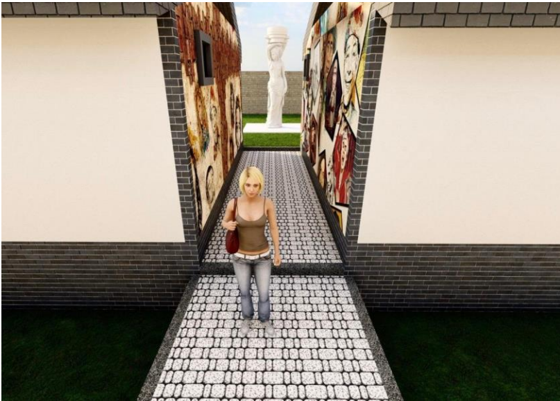
The works of our various painters in our art street