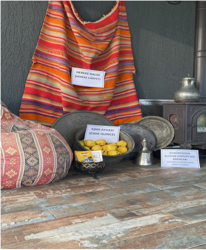
Authentic elements of traditional and contemporary local culture